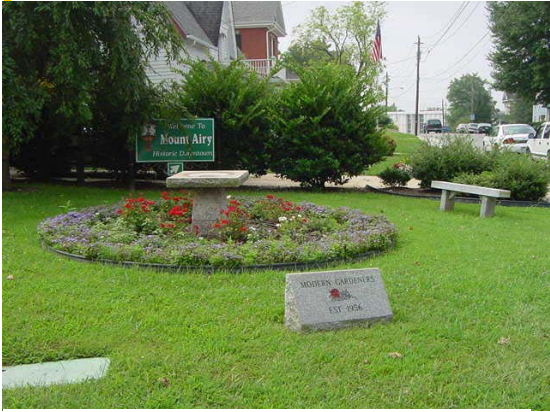
Birdbath, bench and commemorative sign

STREETSCAPE CURBING ASHLAR BLOCKS, PAVERS & LANDSCAPING ACCESSORIES