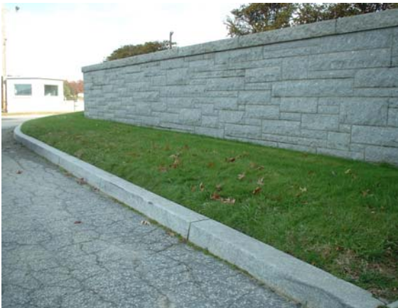
Matching ashlar retaining walls and curbing.