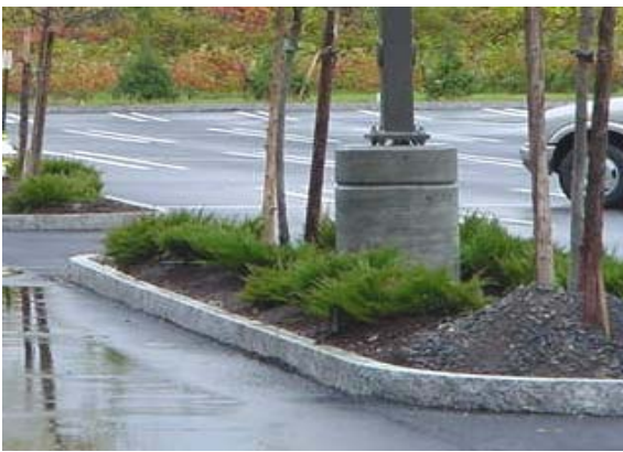
Granite curbing protects high traffic parking areas.